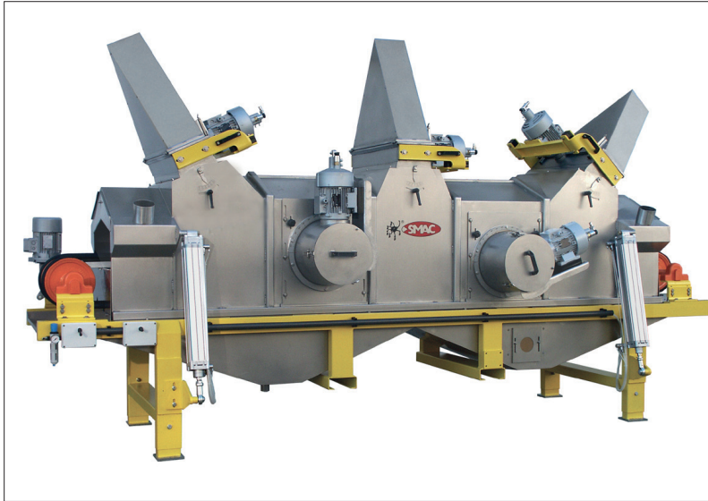
Fig. 2 MULTIGLAZE 7